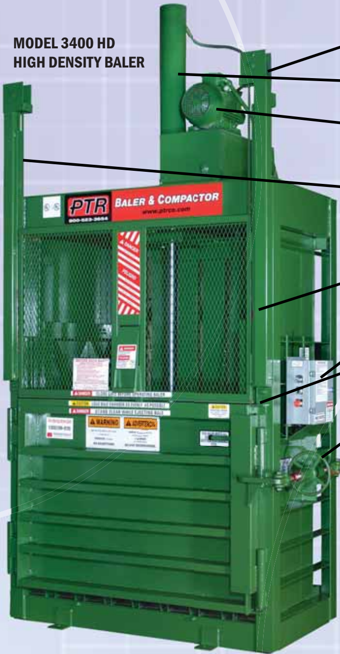
MODEL 3400 HD HIGH DENSITY BALER

CONCEALED PROXIMITY safety switch prevents automatic operation unless the gate is fully closed, and reduces operator influence.